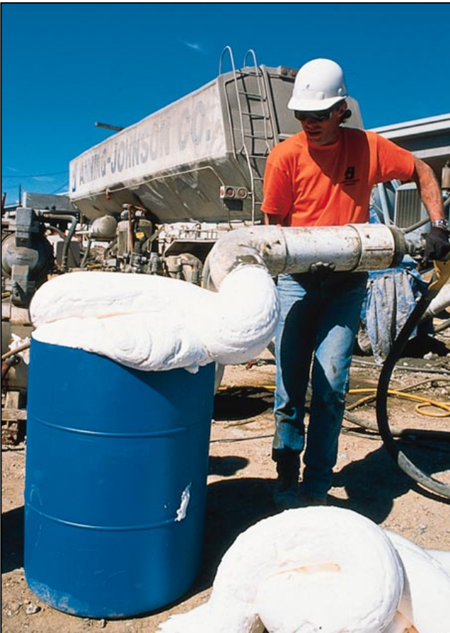
Containing large volumes of air, preformed foam has the consistency of shaving cream. Contractors can control the density and compressive strength of cellular concrete onsite by varying the amount of foam injected into it.